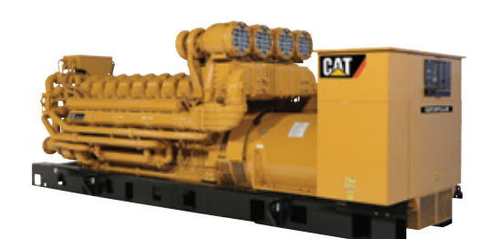
CAT® DIESEL GENERATORS 12 to 17,460 kW / 15 to 21,825 kVA

Health care facilities reduce operating costs by implementing a combined heat and power (CHP) system using clean pipeline natural gas as a fuel source. Cat gas generator sets can simultaneously provide electricity for electrical loads and convert waste heat into a server cooling source via absorption chillers. The result is a power system with energy efficiency up to 90 percent, reduced energy costs, and Energy Efficiency Points toward Leadership in Energy and Environmental Design (LEED) Certification.