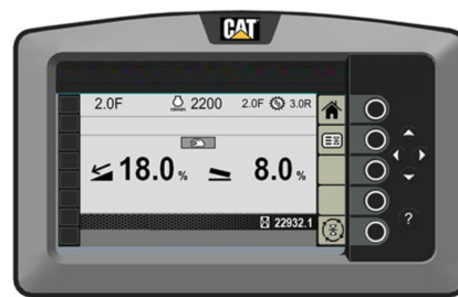
Cat Slope Assist Basic Screen