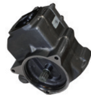
Oil Pump Cooler