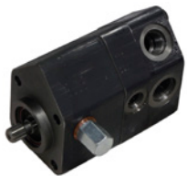
Fuel Transfer Pump