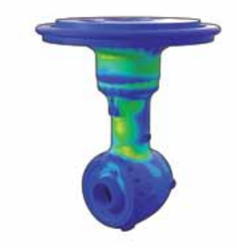
Structural optimization and verification by advanced simulations