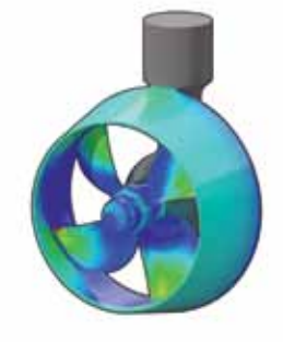
Hydrodynamic optimization by CFD simulations

The BAT meets the requirements of all major classification societies.