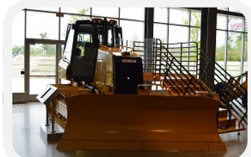
D5K2 Track Type Tractor