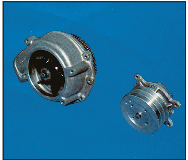
Figure 2 图 2

Full Core Refund 全部旧件退款 Fully assembled 3406 and 3208 pumps 完全组装的 3406 和 3208 泵