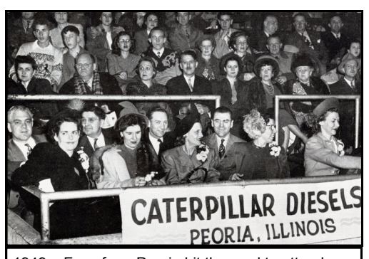
1949 – Fans from Peoria hit the road to attend a Caterpillar Diesels v. Phillips "66" Oilers game in Tulsa, Oklahoma.

The Peoria area rallied around the team during its games at the Field House on the Bradley University campus, while the nation rallied around the team during its gold medal victory in the 1952 Olympic