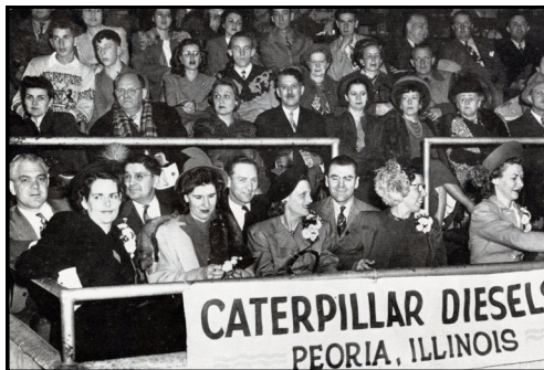
1949 – Fans from Peoria hit the road to attend a Caterpillar Diesels v. Phillips "66" Oilers game in Tulsa, Oklahoma.

Former Caterpillar basketball players unveiled the new exhibit at the Caterpillar Visitors Center on Saturday, March 8. The exhibit will be open until June 30.