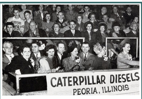
1949 – Fans from Peoria hit the road to attend a Caterpillar Diesels v. Phillips "66" Oilers game in Tulsa, Oklahoma.

In Helsinki, the U.S. basketball team was the only undefeated team after the first six games. The U.S. played Argentina in the first game of the final round, winning 85-76. The U.S. was then matched with the Russian team. The Russian team played a tight control game, and few points were scored. At the end of the first half, the score was 17-15, with the U.S. in the lead. The U.S. built their lead in the final six minutes of the game, defeating the Russians 36-25. The U.S. basketball team won the gold medal.