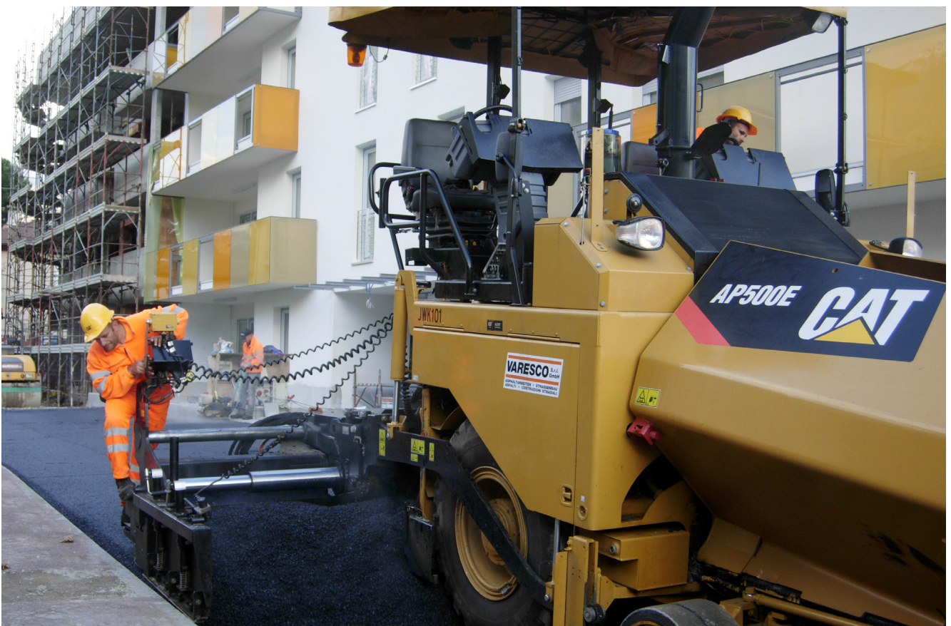
^ Screed functions could be adjusted on the move as required.

In addition, manoeuvrability of the paver and quick adjustment of the Cat AS4252C Screed proved important on the narrow street. “The paver has a great screed, with optimum steering,”