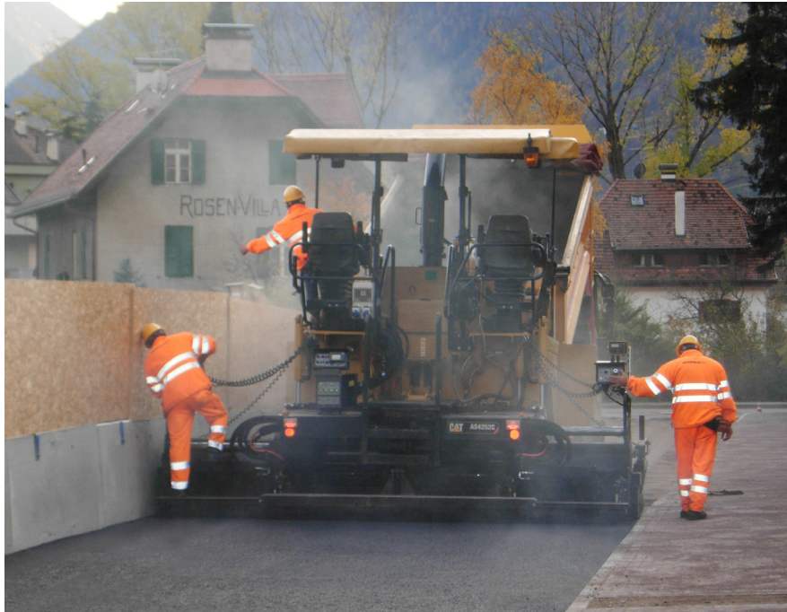
The machine’s manoeuvrability was vital on the twisty streets. ^

“The machine is quite easy to move according to your needs in any working environment, from small jobsites like residential street works to industrial yards, from local and regional streets to narrow mountain roads that represent the majority of our jobs,” he said. “I appreciate the electronically controlled traction, the recovering of fumes, the perfect operation of the electric screed and the easy access to all major service points for daily maintenance.” ■