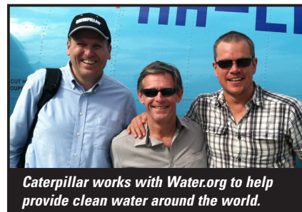
Caterpillar works with Water.org to help provide clean water around the world.

To learn more about the global impact of the Caterpillar Foundation, please visit caterpillar.com/foundation .