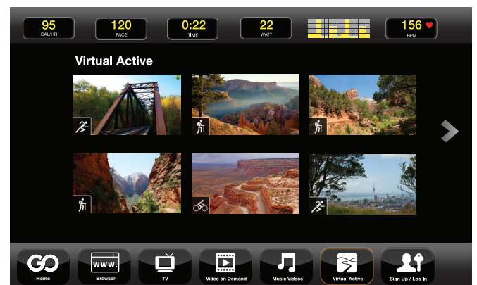
ESCAPE WITH VIRTUAL ACTIVE