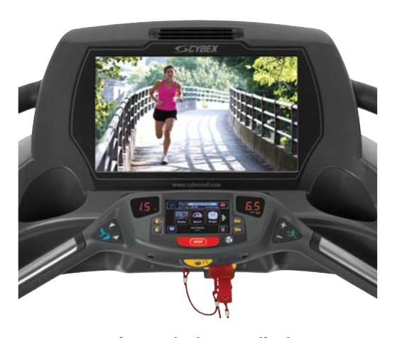
E3 View HD/Cybex GO display Optional (see page 10 for details)