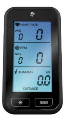
ANT+ Console display Optional

We believe measurement matters. Performance measurement permits the instructor to demonstrate effectively both intensity and effort, and enables the student to gain more from every class. Our ANT+ console shows cadence, heart rate, calorie expenditure and other data, giving students immediate and valuable feedback on the intensity of their training effort.