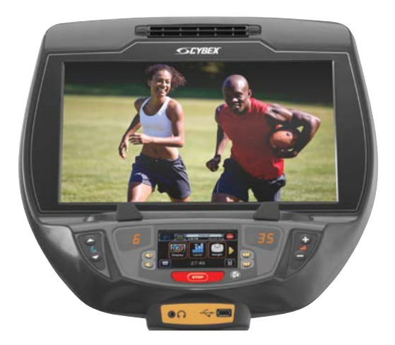
E3 View HD/Cybex GO display Optional (see page 10 for details)