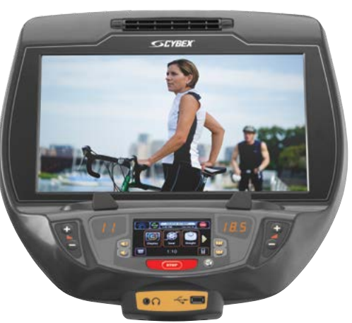
E3 View HD/Cybex GO display Optional (see page 10 for details)