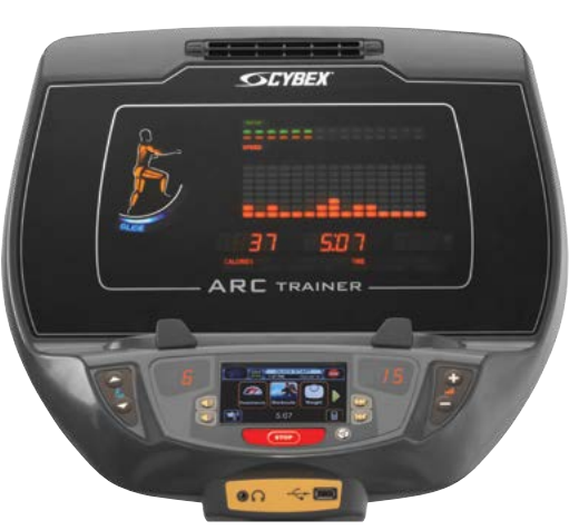
Muscle Map standard display